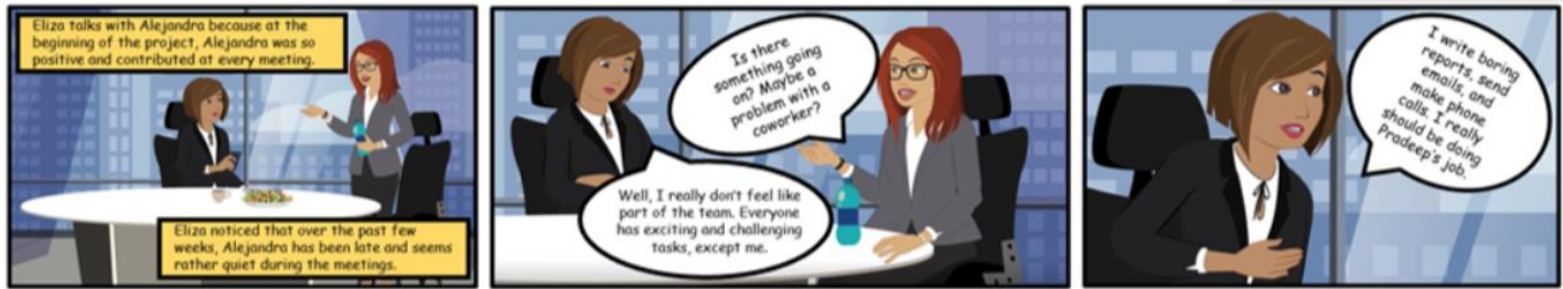
Example of a Comic Strip on the Exam

Animation video: For animation video items, candidates will watch the animation video. Candidates can watch the animation multiple times and use the video controls to start, stop, rewind, etc. Based on the scenario, the candidate will be presented with a multiple-choice question to answer. Candidates will receive headphones at the testing center. The animations will have audio and will also include closed captioning.