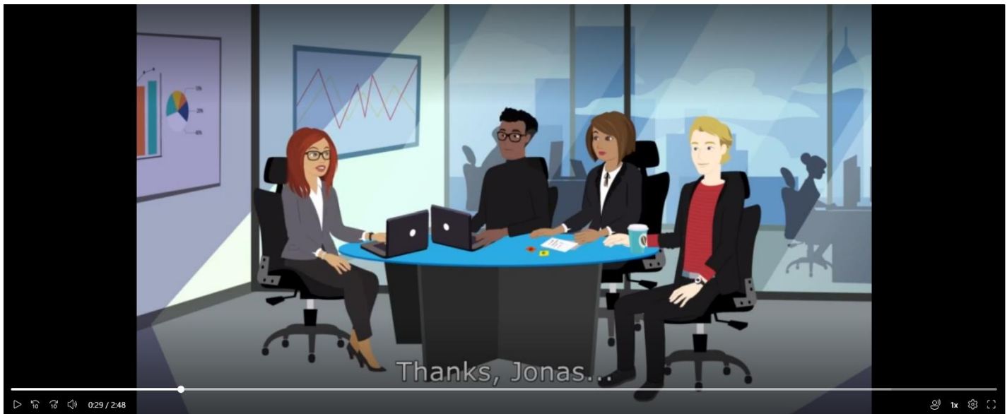
Example of an Animation Video on the Exam

Enhanced Matching: For most enhanced matching (drag and drop) items, candidates will see two columns of boxes. They will be given a scenario and will need to match the boxes on the left with the boxes on the right (opposite for Arabic candidates). They will simply click and drag one of the boxes on the left-hand side and place it on the appropriate box on the right-hand side. They will do this for all the boxes in the left-hand column.